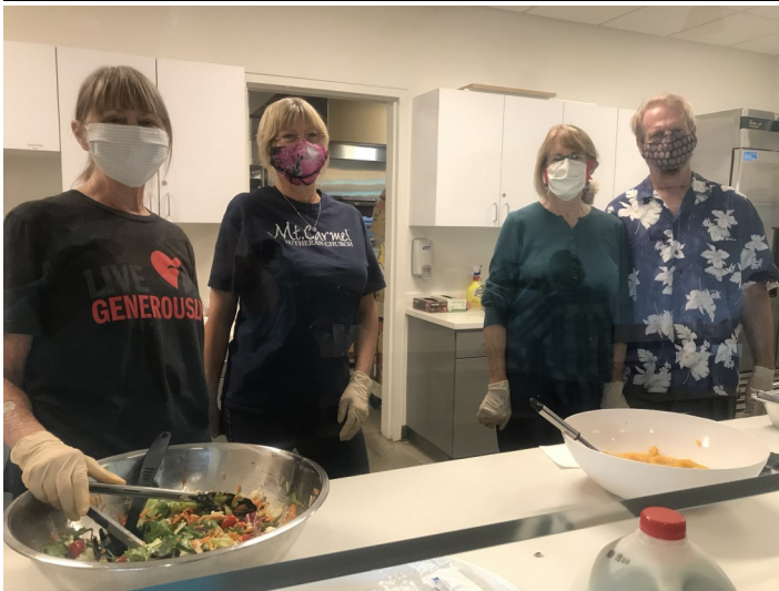
Serving up a delicious hot meal in November at the People's Kitchen!

Please have your clearly marked items at church by 11:00am, (heated and ready to go)