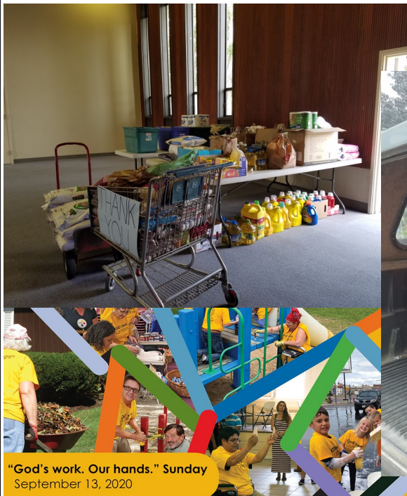
"God's work. Our hands." Sunday September 13, 2020

Thank you to everyone who participated in our 'God's Work, Our Hands' event on September 12. We held a drive-thru food drive benefiting Iglesia Santa Cruz. Your donations helped provide much needed basic food supplies for the members of our sister congregation in Santa Maria. Here are a few pictures after the event: