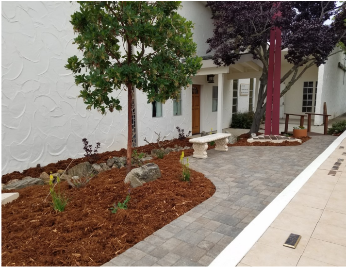
Memorial Garden Makeover—July 2019