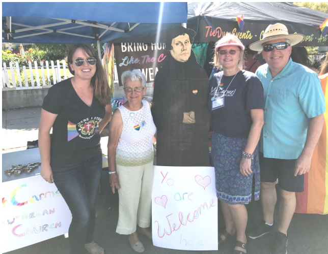
Pride in the Plaza Festival—July 14, 2019