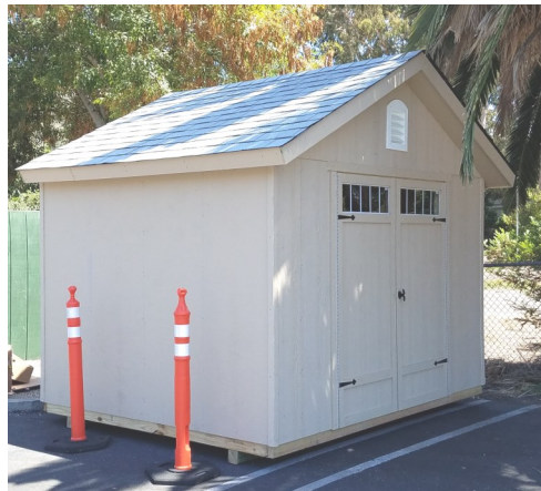
New Tool Shed—July 2019