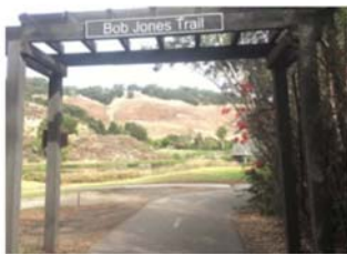
Take a Hike