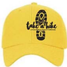
Receive this Collectors Hat